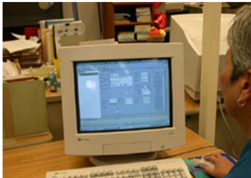
The Land Division's new computerized system has streamlined information management in the Division.

The budget of the Land Division this fiscal year (2001-2002) is $5.6 million. The Land Division offices on Oʻahu, Kauaʻi, Maui, and Hawaiʻi employ 38 individuals to manage our public lands.